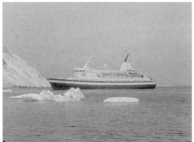
Figure 2. Expedition vessel M/S Explorer and icebergs in Antarctica.

Plague, caused by Yersinia pestis , is usually transmitted by the bite of a flea living on rats. Although plague is not described in contemporary literature on shipboard illnesses, the role of traveling ships is quite prominent in the transmission and spread of plague. The Black Death, for example, which spread along the established trading routes of the Mongol empire, began around 1320, wiping out at least one-third of the populations surrounding the Mediterranean and adjacent lands [20].